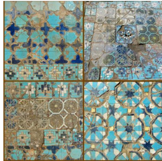
Figure 2: Archaeological excavations in Aksaray.

conservation of the architectural building 3-4 meters south of the ruins of the entrance. At a depth of 1.5 meters above the current earth surface it was discovered a wonderful combination of different colored tiles on the surface of the building (Figure. 2).