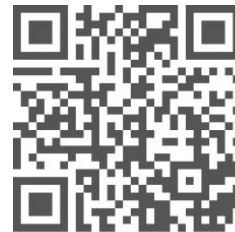
Figure 8: Aksaray 3D animation and sound.