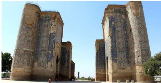
Figure 1: Amir Timur's Aksaray Entrance Peshtak.