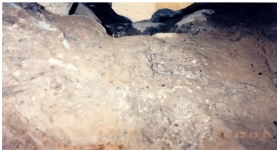
Figure 4: Stacking of stone rocks.

Therefore, the main effort was spent in the last years to build a dedicated BIM system with this specific goal: supporting to the operations of the restoration yard.