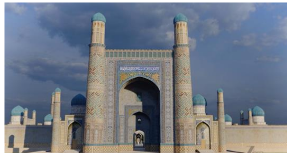
Figure 5: Virtual graphic reconstruction of Aksaray, performed by author.

Improving Information and Understanding: Scientific researchers and tourists know that the process of guided tours should focus on inspiration and interaction. Their goal is to get tourists interested in the subject or theme. Tourists should not be mere listeners and passive observers, some tourists, especially teenagers, need practice and hands-on experience.