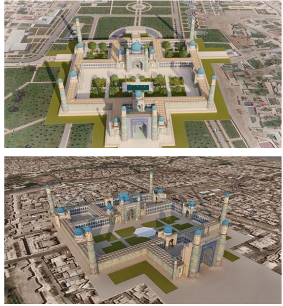
Figure 7: 3D models (Scheme of schematic reconstruction of Aksaray) by author.

Moreover, AR offers an enhanced combination of different types of historical sources and visualizations, including 3D models, images, text, video, animation and sound, along with traditional methods to enhance the tourist environment.