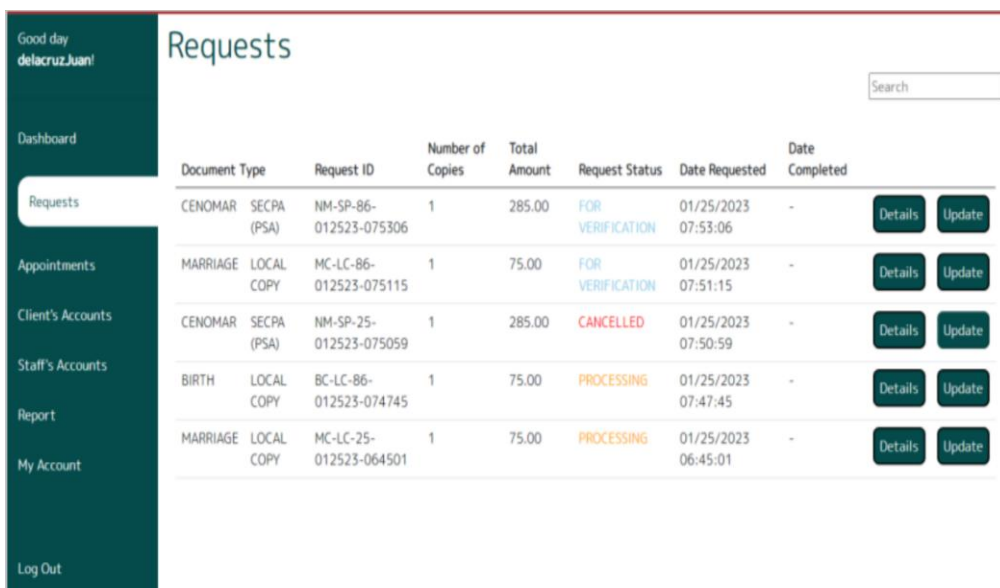
Figure 4: User interface of the web-based application for the online transaction system of the GMA Civil Registrar.