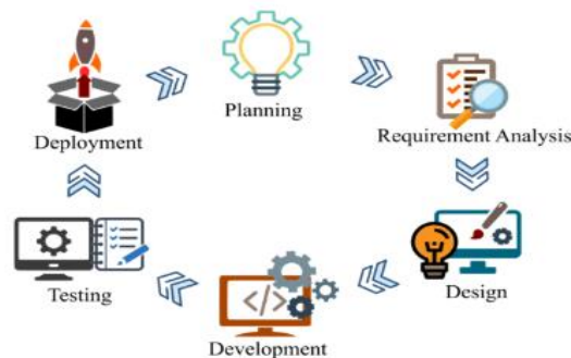
Figure 1: Model for agile software development.

In the development of the application, an agile methodology approach was used; this approach to software development interleaves program planning, requirement analysis, design, development, testing, and deployment [6]. Every organization has incorporated agile software development into its everyday operations and modified its project development methodology [25]. It "evolved from the personal experiences and collective wisdom of consultants" rather than being created.